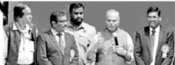
मॉडर्न कॉलेजतर्फे आयोजित राष्ट्रीय परिषदेच्या उद्घाटनप्रसंगी