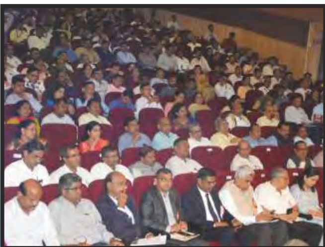
Participants of the Seminar